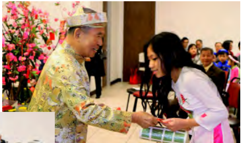
Wishing the elder longevity