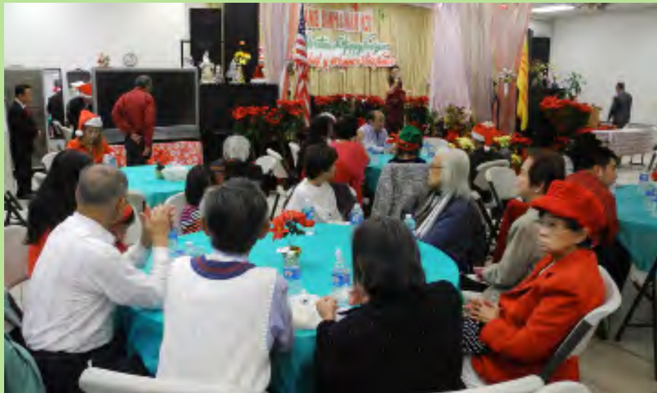
Vietnamese-American Community had its own Christmas Celebration