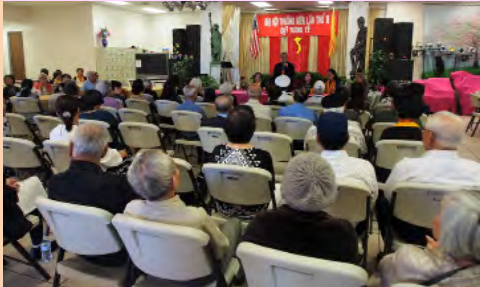
The Mutual Aid Fund hosted its 2018 general annual meeting

The Center accommodates both traditional Vietnamese observances such as Tet and the Fall of Saigon, as well as other holidays such as the Fourth of July, Halloween, Thanksgiving, Christmas, and New Year's Day. Considering our deeply-ingrained commitment to diversity and inclusion, the Center, through the talent and determination of our affiliated ethnic and cultural groups successfully hosted the International Festival in late October. The festival provided food and entertainment from eight countries: Cuba, El Salvador, Honduras, Mexico, Nicaragua, Guatemala, Peru and Vietnam. Lastly, the Center also celebrates collective Wedding Anniversaries, Mother's Day, Father's Day, and perhaps most importantly, Grandparent's Day.