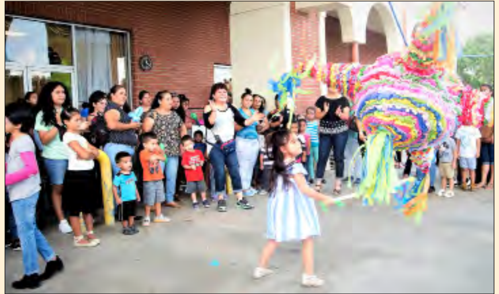
Pinata fun marking the end of Summer session

During the summer of 2018, the Corporation piloted the Kids Cafe Program to support the low-income families who have children living around the Center. The Houston Food Bank sponsored Kids Cafe program collaborates with chefs, dietitians, students, and volunteers. Its mission program is to help alleviate hunger by providing children with nutritious meals during the summer. This is especially helpful for kids who otherwise depend on school lunches for their daily nutrition. Kids Cafe Programs provide free meals and snacks to low-income children.