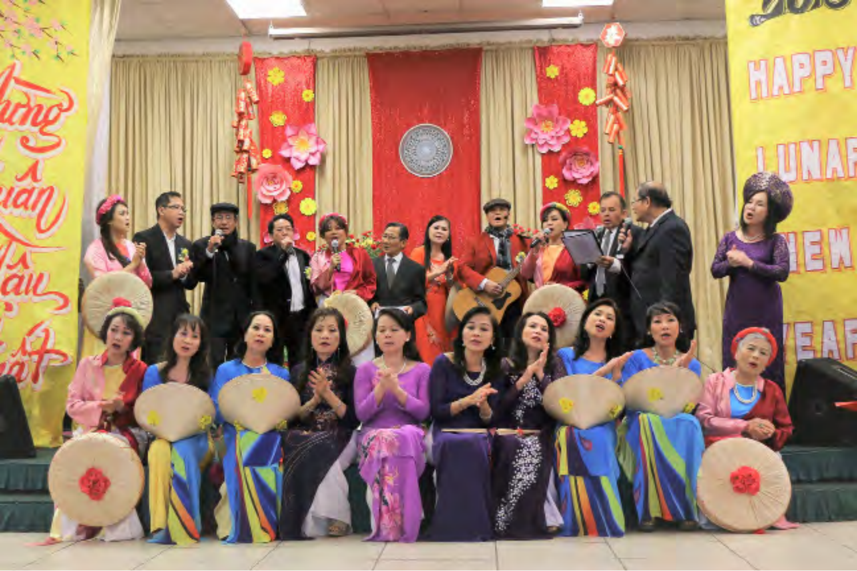
Performing “Ly Ruou Mung” by Zen Tai Chi Group