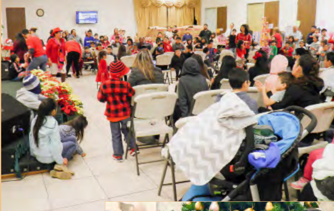
The Hispanic Community gathers to warmly celebrate the meaning of family at Christmas.