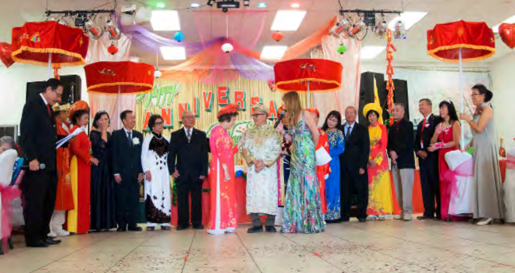
Happy Wedding Anniversary