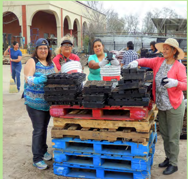
Volunteers prepare soil for seeding.

Community gardens contribute to healthy lifestyles by providing fresh and affordable herbs, fruits and vegetables. Not only do they help to relieve stress and encourage wellness, but they also provide social opportunities to build a sense of community and share a knowledge of gardening, and cooking.