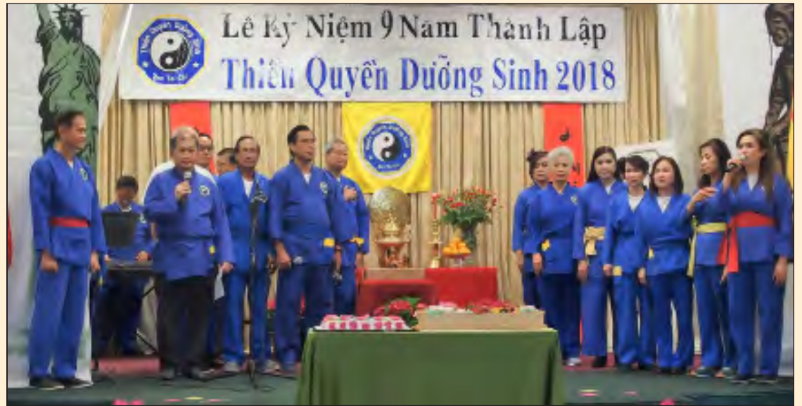
Practicing Zen Tai Chi regularly help these members promote a healthier body and mind.