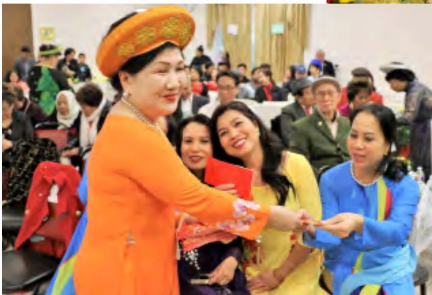
... with the hope of getting back a fortune