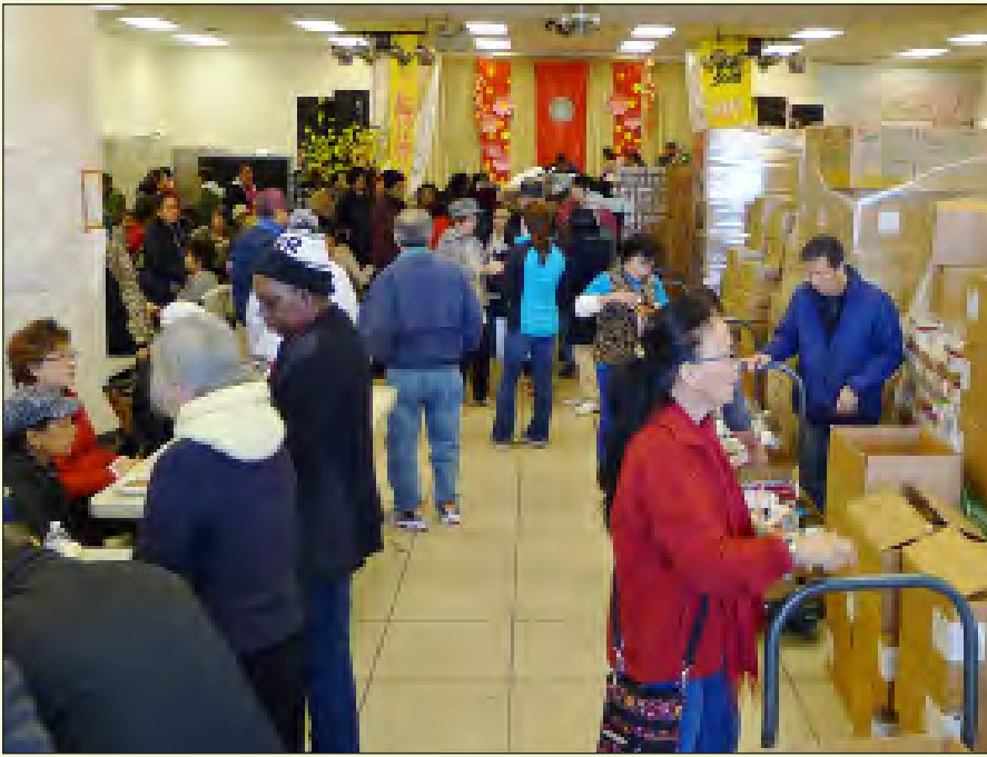
Annam Community Center joins the Houston Food Bank and television channel ABC13's Share Your Holidays Food Drive in this annual tradition. This year, it has distributed fresh meat, grocery and produce to 719 low-income families.

Long before Hurricane Harvey, the Center has served the Greater Houston Area in various ways. As an immediate responder, we have donated stockpiles of household items, clothes, and blankets as well as regularly distributed fresh produce, meat, and drinking water. Within the first six months of 2018 alone, the Center delivered food and household items, which totalled to 567,535 pounds, from the Houston Food Bank, Costco, and Prince of Peace Church. Additionally, the Center has continued to partner with Prince of Peace Parish who gifted excess donation items to the Center, helping a total of 2,358 families in the process.