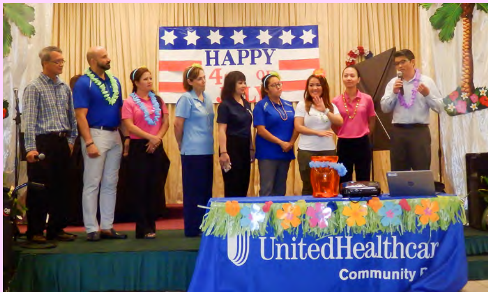
United Healthcare has sponsored all transportation fee for the Center