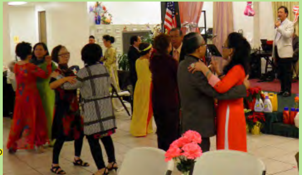
Dancing to usher in the New Year at the end of 2018