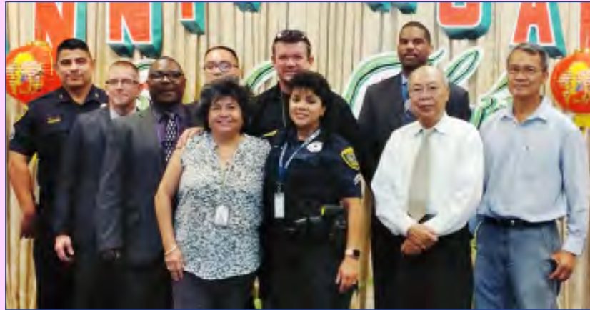
Community Awareness is conducted by Houston Police Department at the Center

In 2018, the Center also partnered with both the Harris County Precinct 4, Department of Transportation and the City of Houston Police Department. The former helped organize an astonishing 12 field trips for seniors to experience Houston attractions. The latter, helped arrange a public safety and awareness program. In this program, various city officials delivered educational presentations on public and personal safety, theft and fraud prevention, and domestic violence.