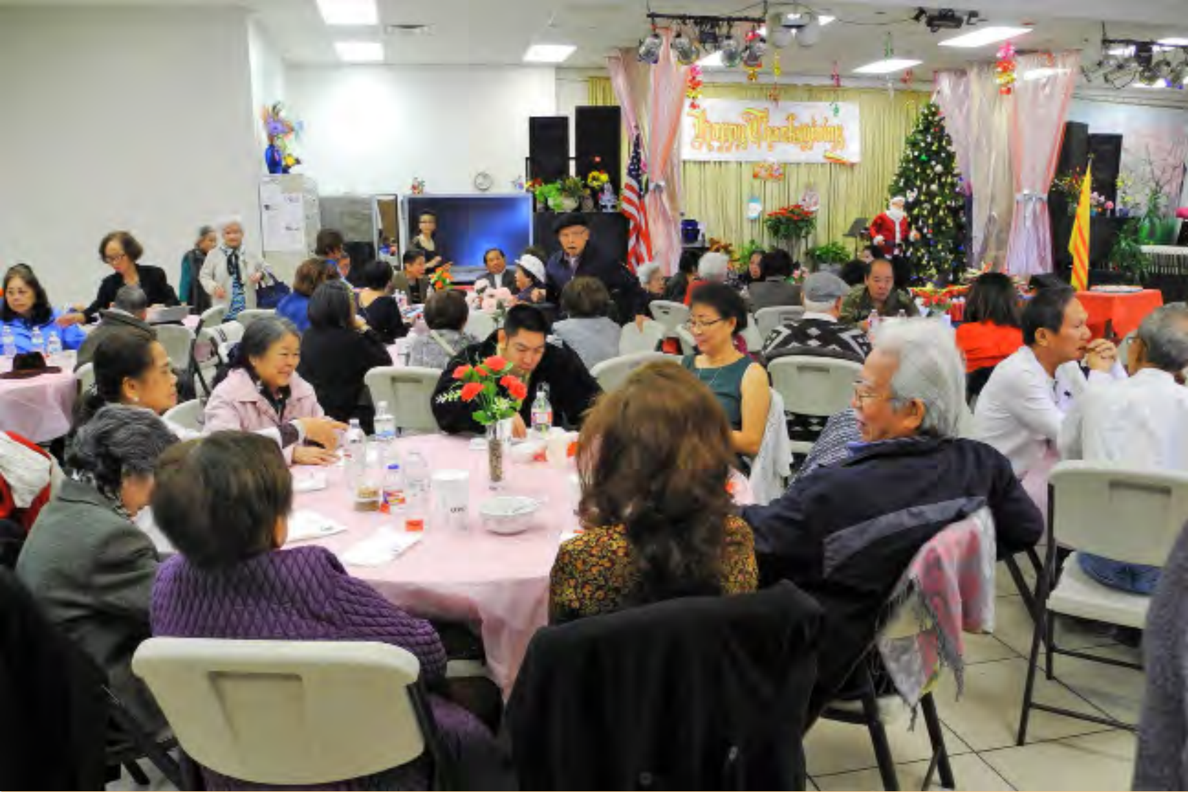
Happy Thanksgiving 2018