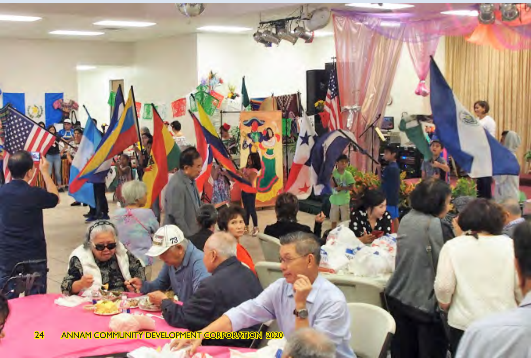
International Festival opening

The purpose of the International Festival is to grant all ethnic groups the opportunity to express and share their cultural identities through music, dance, and food. The Center hopes that this initiative will give community members the opportunity to rise above their differences and achieve mutual appreciation and understanding.