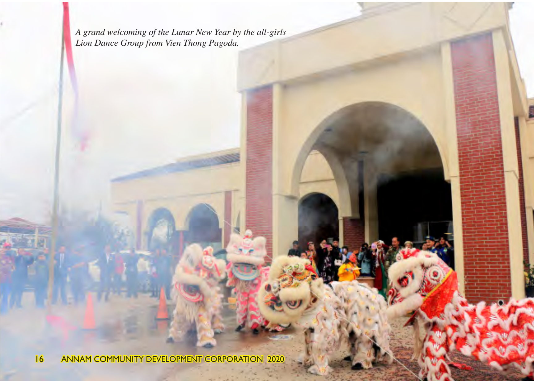
A grand welcoming of the Lunar New Year by the all-girls Lion Dance Group from Vien Thong Pagoda.

Paying respect to the long-standing practices of Tet, the Annam Community Center has retained the main features of the Lunar New Year with many Vietnamese and non-Vietnamese community members alike. At the Center, Tet includes a mesmerizing a lion dance, musical performance, feast, and the exchange of good wishes.