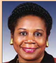
The Honorable Sheila Jackson Lee U.S. Congress